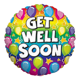
To all who are ill May the Lord bless, show kindness, grant health and peace to everyone

Share the news of your family or of our community and their family*