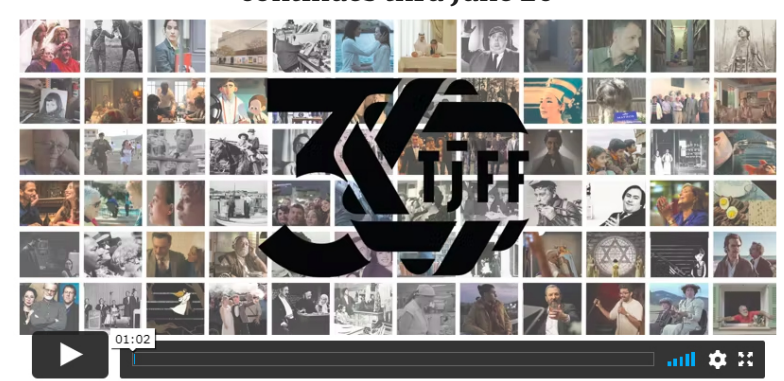
For more about the films and for tickets

JJFF Toronto Jewish Film Festival continues thru June 26